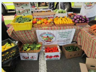
Free Farmers Market set up in Lower Bucks County

One of the most rewarding aspects of our operation is that we are able to be more responsive, and flexible enough to immediately serve new hunger-relief sites that reach out to us for help. We continue to strengthen our relationships with local social service organizations like the Bucks County Opportunity Council, Bucks County Housing Group, Bucks County Foodshed Alliance, YWCA social service programs and the Hunger Nutrition Coalition to better identify underserved areas. Several new distribution sites were added in 2014, including Mercer Street Friends Food Bank and Homefront, both in Ewing, NJ. That has enabled us to serve more of the low-income senior population that is becoming increasingly vulnerable to hunger.