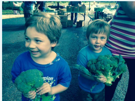
Kids love our veggies, too!

We will continue to source and distribute fresh, healthy, locally grown food that provides our neighbors in need with much healthier food choices. There is so much surplus available in our area, that we at Rolling Harvest Food Rescue are committed to continuing to connect farmers to families in need.