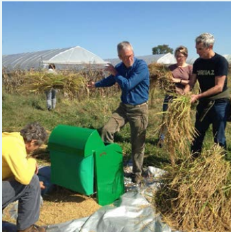
Gleaning rice at Blue Moon Acres

More than 25 local farms and producers now partner with us. They generously share their surplus and wonderfully irregular produce with us to distribute wherever the need is greatest. These farms also invite us to pick in their fields, with 19 gleaning/harvesting volunteer events in 2014 that provided many more thousands of pounds of gorgeous produce to distribute at its peak. Rolling Harvest volunteers braved heat and cold and storms to harvest this gift for the food pantries. We are creating partnerships with several area schools, creating "teen glean teams", connecting youth with nature and supporting community-service values.