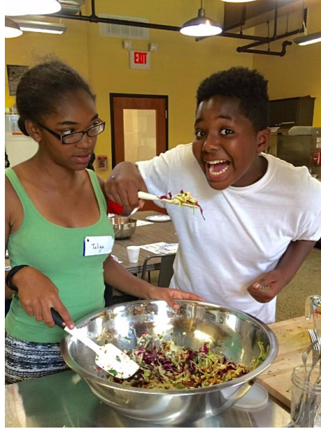
Kids love our veggies, too