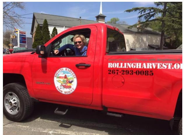
Our "Jimmy" truck

We have great partners in the community--thanks to Local Wisdom, a local digital design company, we were able to bring you a new, interactive website this year to make it easier to partner and volunteer. And imagine our joy when former Phillies baseball legend Jimmy Rollins decided to gift us the brand-new Chevy Silverado pick-up truck he won as part of his Roberto Clemente Humanitarian Award in recognition for all that his Rollins Family Foundation has done to address food-insecurity in the region! We also offer a huge shout-out to our Bucks County Commissioners for donating the use of their County cooler and freezer warehouse after we met with them to bring them up-to-date on all the collaborative work being done-this