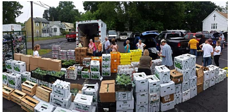
One of our weekly distributions

a real sense of connection and community support takes place, providing an invaluable weekly opportunity to talk and share best practices! And to better identify under-served areas, we continue to strengthen our collaborative relationships with local social service organizations like Mercer Street Friends Food Bank and Homefront NJ, the Bucks County Opportunity Council, Bucks County Housing Group, Bucks County Foodshed Alliance, Philabundance, Greater Philadelphia Coalition Against Hunger, United Way, YWCA social service programs and the Hunger Nutrition Coalition.