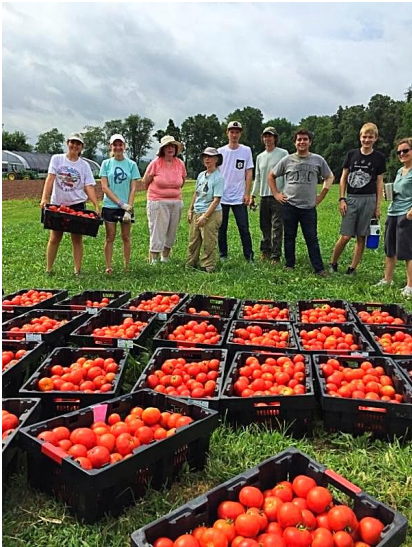
Volunteers make it all happen!

More than 33 local farms and producers now partner with us. We continue to be in awe of their generosity and commitment to community and hunger relief. They generously share their surplus and wonderfully irregular produce with us to distribute to wherever the need is greatest. These farms also invite us to pick in their fields. 2016 saw an increase in weekly gleaning/harvesting volunteer and corporate/community group opportunities that provided many more thousands of pounds of glorious produce to distribute at its peak. Rolling Harvest volunteers braved heat and cold and storms to harvest for the food pantries,