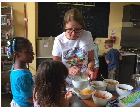
Rolling Harvest Nutrition Outreach

"I put your veggies in with our spaghetti dinner, and couldn't believe my kids ate it all up!" - Food pantry client